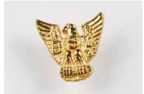
Distinguished Eagle Scout device, No. FB00094 (10K gold)