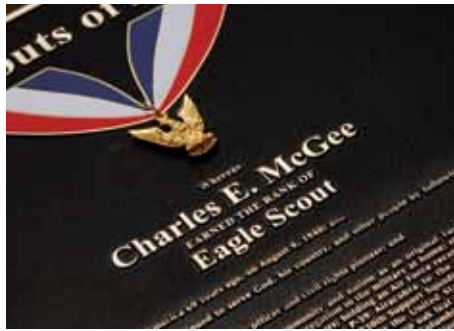
Black matte plaque, No. FB17575. This plaque displays the name and resolution in elegant raised gold letters on a 14-by-10-inch black-matte metal plate. Allow 10 to 12 weeks for delivery.