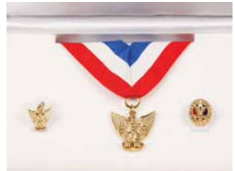
Presentation kit, No. FB00330. The presentation kit includes a gold-filled eagle pendant on a 24-inch red, white, and blue grosgrain ribbon; a gold-filled oval eagle lapel pin with post/clutch attachment; and a gold-filled eagle charm. The gold-filled lapel pin, No. FB00328, can be purchased separately.

Note: Allow up to 12 weeks for delivery of the plaque after the order form has been submitted to the national Supply Group.