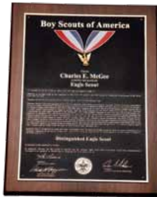
Distinguished Eagle Scout Award plaque. The Distinguished Eagle Scout Award plaque is available in two versions: black matte and photo etched. Both versions are mounted on a handsome 16-by-12-inch, solid walnut plaque and feature a striking gold-finish eagle suspended from an enameled red, white, and blue ribbon.

The citation is prepared by the council on form No. 542-031 (a fillable PDF is available at www.NESA.org ) and submitted with the DESA order form only after the DESA Selection Committee has notified the council of a positive decision.